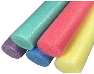
RoadRunner Pool Noodle No Hole 58"x2.5"

So many uses for this great piece of equipment. But remember there is wide variety in density and length, both will affect buoyancy and usefulness for exercise. Recommend no hole, high density foam, and at least 58" length. Here, from Amazon: