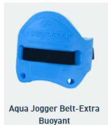
Aqua Jogger Belt-Extra Buoyant