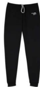
Bamboo Neoprene Tights - Women's - Black