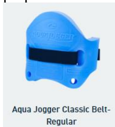
Aqua Jogger Classic Belt- Regular

Floataion belts come in a wide variety of sizes and materials, and the cost can vary. They can be found at all of the above-mentioned websites. Less expensive: Belts from Kiefer Aquatics (shown below) as they are the only company whose product features an elasticized belt, which is nice when adjusting for proper fit.