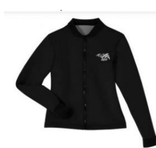
Bamboo Neoprene Straight-Cut Jacket - Women's - Black